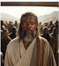
ANDREW; Samuel L. Jackson