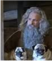
ZACHARIAH; Mel Brooks