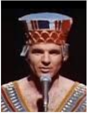
STEVEN; Steve Martin