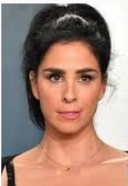
ZELLA; Sarah Silverman