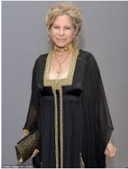
ELIZABETH; Barbra Streisand