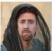
JACOB; Nicolas Cage